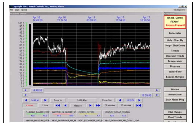
Juneau Douglas WWTP Incinerator Trend Screen. Juneau, Alaska